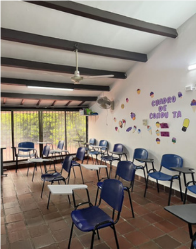
Seats waiting to be filled by our Latin American students.